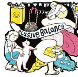
Elusive Balance: Iowa Artist/Mother group 6/11 - 9/5 Opening Reception: 6/11, 5-7pm