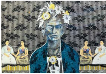
From the Collections Through 6/5

Juried Exhibition & Art Auction Through 6/5