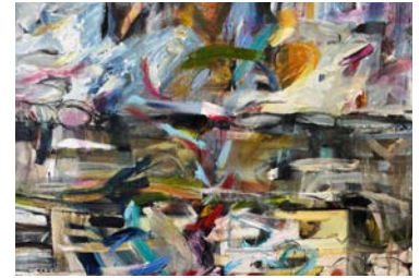
Sarah Grant: Land, Sky, Stem: A Retrospective in Line and Color 6/25 - 9/16 Opening Reception: 6/25, 5-7pm