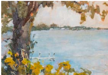
Okoboji Plein Air Invitational 9/10-11/7 Opening Reception: 9/10, 5-7pm