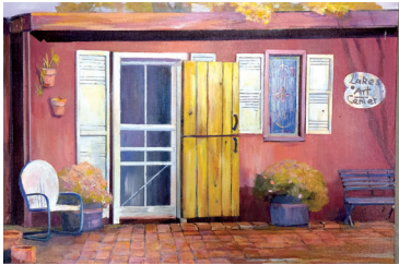
Creating History: The Pearson Lakes Art Center Book Exhibit 4/20 - 6/17 Opening Reception: 4/20, 5-7pm