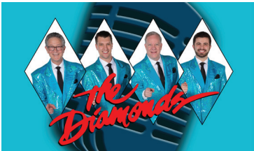
The Diamonds | July 12