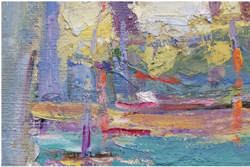
Celebrate the Arts! Juried Exhibition & Art Auction 4/27 - 6/3 Opening Reception: 4/27, 5-7pm