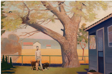
Selections From Our Collections 1/19 – 3/4