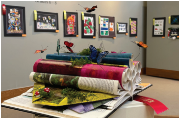
Dickinson County All School Show 3/11 - 4/15