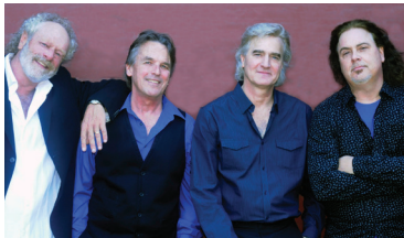
The Grassroots | August 8

Thursdays, 2:30-3:30pm or 4:00-5:00pm Members $36 | Non-Members $48