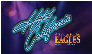
Hotel California | June 6 & 7

Be on the lookout for member only pre-sales in February and March!