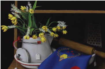
Be Still: Denice Peters Through 3/4