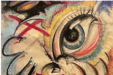
Out of the Fire : Jacob Van Wyk Through 1/14