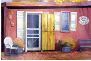
Creating History: The Pearson Lakes Art Center Book Exhibit Through 6/17