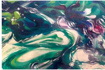
Won Kim: Summer Breeze 7/27-9/16 Opening Reception: 7/27, 5-7pm