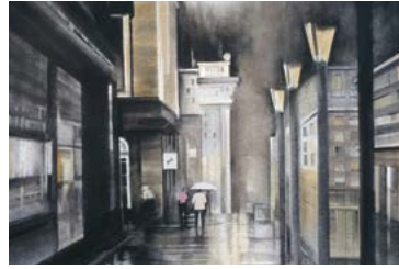
Telagio Baptista 5/11-7/22 Opening Reception: 5/11, 5-7pm