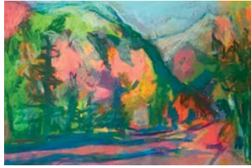
Celebrate the Arts! Juried Exhibition & Art Auction Through 6/3