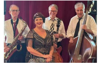
August 24: Paper Moon

6:30-8:30pm | FREE | Supported by Dells Garden Center