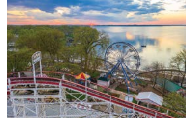
Tom Gustafson: DronesCAPES 6/15-8/12 Opening Reception: 6/15, 5-7pm