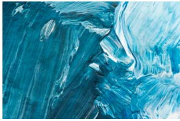
Biennial Exhibition 11/9 – 3/2 Opening Reception 11/9, 5-7pm