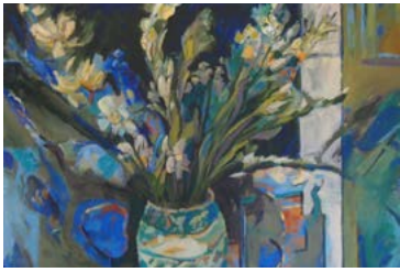
Selections from Collections 11/2 – 3/9