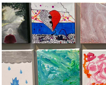
What is Disability? Mural Project Through Feb. 28