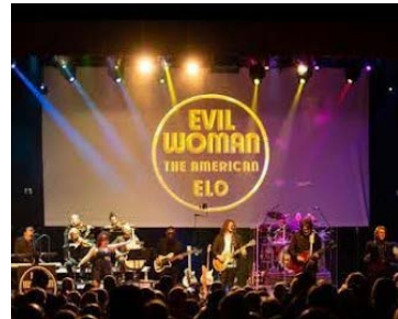
Electric Light Orchestra Experience | July 21