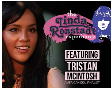
Linda Ronstadt Experience | June 30