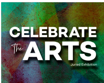
Celebrate the Arts! Juried Exhibition and Art Auction May 7 - Jun. 5 Opening Reception: 5/7, 5-7pm