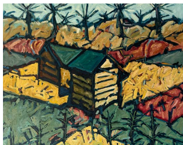
From the Collections Apr. 16 - Jun. 20