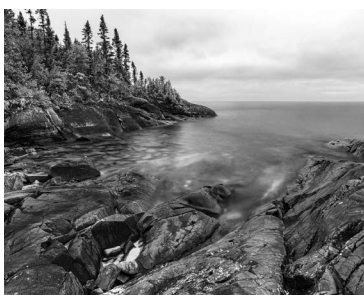
PLAC Biennial Exhibition Through Feb. 21