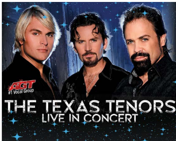
Texas Tenors | June 16 & 17

Be on the lookout for member-only presales in February and March!