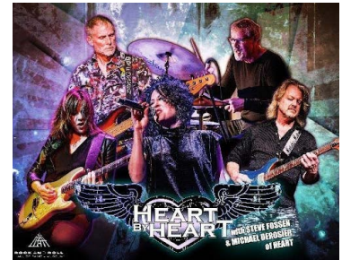
Heart By Heart | July 28