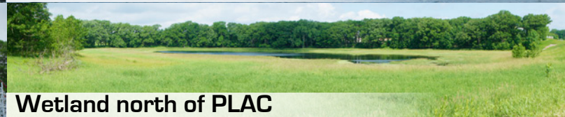
Wetland north of PLAC