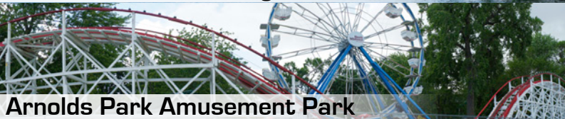
Arnolds Park Amusement Park