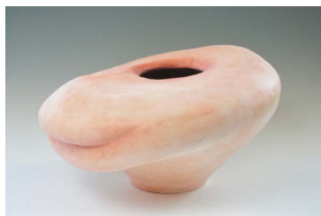
Kelly Devitt: Ritual 5/16-7/20 Opening Reception: 5/16, 5-7pm