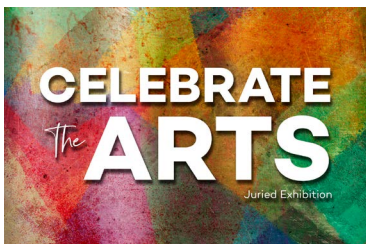
Celebrate the Arts! Juried Exhibition & Art Auction 4/25-5/31 Opening Reception: 4/25, 5-7pm