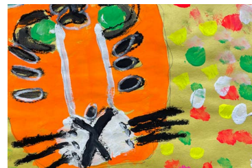
Dickinson County All School Show 3/8 - 4/13