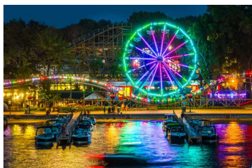
Okoboji's Photographic Palette 4/18 - 7/6 Reception & Book Release: 5/23