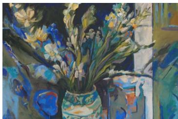
Selections from Collections Through 3/2