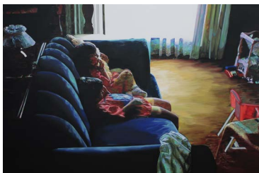
Biennial Exhibition Through 3/2